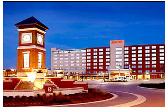
The 2010 International Snowmobile Congress hosted by ISSA will be held at Marriott Coralville Conference Center June 9—12.